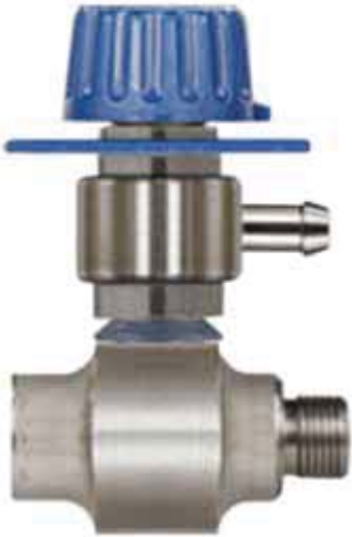
Easy to read dial